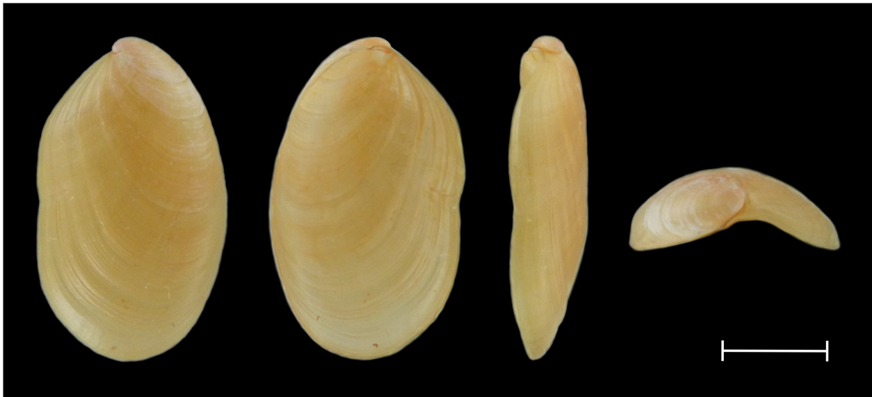
Figure 6. Shell of Omalonyx unguis from Garupá stream beach (IBS-Ma 073/1) in dorsal, ventral, lateral and protoconch views. Scale bar = 5 mm.

the known distribution of the species to northeastern corner of Argentina, bordering on Brazil and Paraguay (Gutiérrez Gregoric et al. 2013). The new records are located at about 250 km west of the nearest record in Foz do Iguacu city, Brazil, and at about 280 km southeast of the type locality in Paraguay.