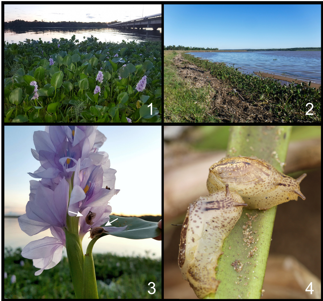
Figures 1–4. Habitat and specimens of Omalonyx unguis from Misiones Province. 1, 2. Eichornia crassipes (water hyacinth) mats in the Mártires and Garupá streams, respectively, where O. unguis individuals were found. 3. Specimens of O. unguis (white arrows) involved in full activity on flowers of Eichornia crassipes at Mártires stream (IBS-Ma 282). 4. Omalonyx unguis (IBS-Ma 042) from Garupá stream floodplain.

collectors: J.G. Peso, R.E. Vogler and A.A. Beltramino, May 2017 (5 specimens, IBS-Ma 042), and collectors: V. Núñez, R.E. Vogler and L.B. Guzmán, November 2017 (5 specimens, IBS-Ma 073) (Table 1, Fig. 5).