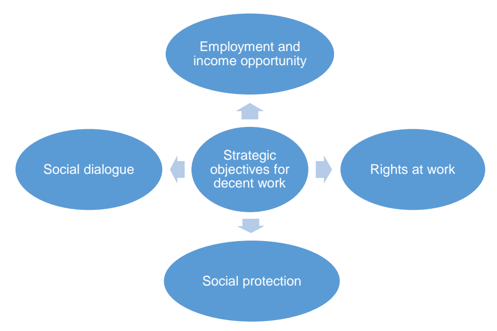
Figure 2 Strategic objectives for decent work